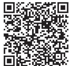
QR code for 2025 Nomination Form